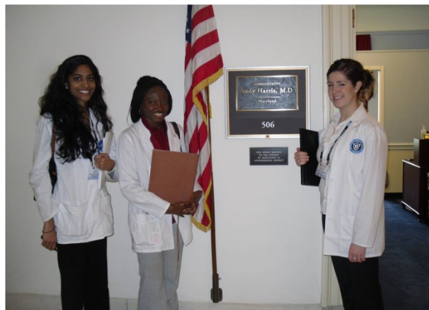
National Association of Chain Drugstores RxImpact Program on Capitol Hill

Note 1: The Admissions Committee will pay special attention to pre-pharmacy math and science coursework that were taken more than five years ago. Science and math coursework that were taken within five years are preferred.