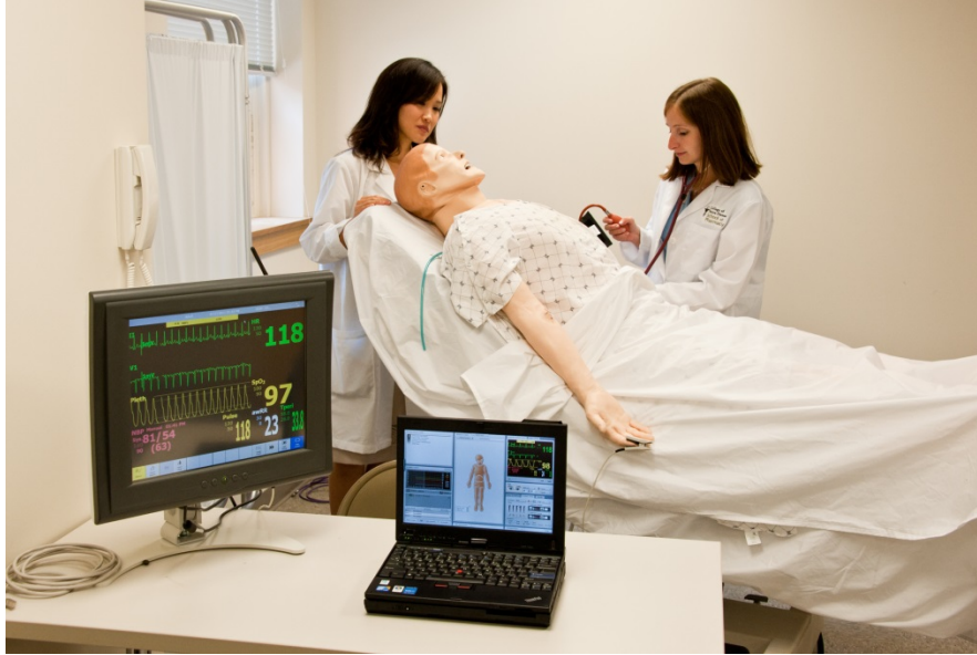
Pharmacy Practice Simulation Lab