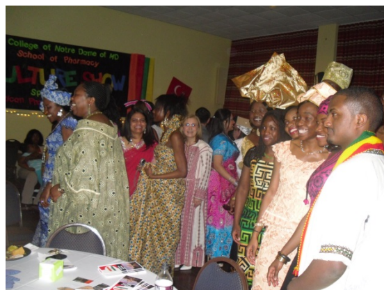
American Pharmacists Association – Academy of Students Multicultural Night

Pre-Requisite Courses (students completing coursework at other colleges or universities of higher learning.)