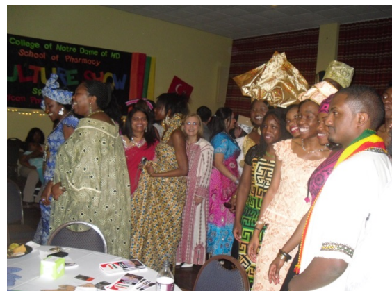
American Pharmacists Association – Academy of Students Multicultural Night