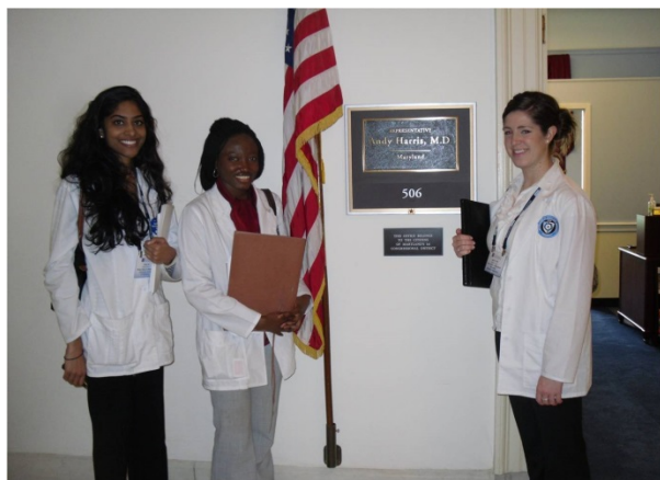
National Association of Chain Drugstores RxImpact Program on Capitol Hill