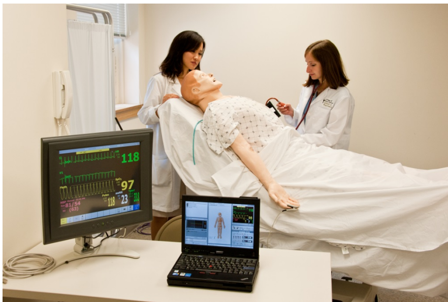
Pharmacy Practice Simulation Lab

All correspondence from University offices is sent to the student's priority address on file in the Registrar's office. Any change to this address should be reported to the Registrar's office as soon as possible. Failure to keep this address up to date may result in delays in receiving important information. It is the student's responsibility to provide the University with correct address information.