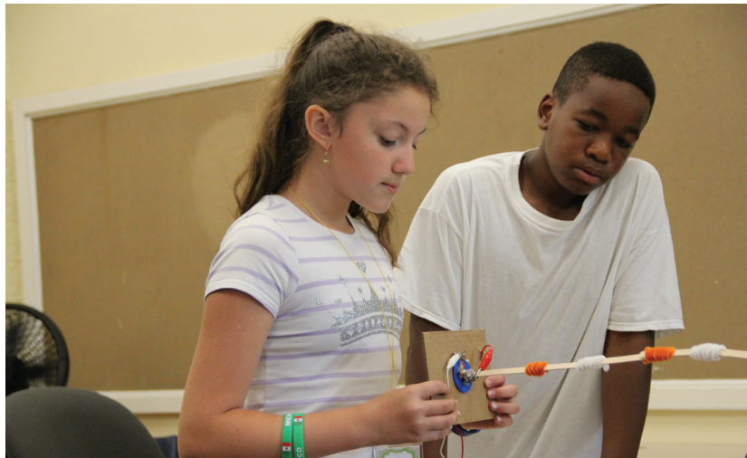
Notre Dame of Maryland University is endorsed by the Maryland State Department of Education as a leader in developing progressive STEM programs.

Join us for an exciting exploration of the world of amusement parks. Investigate different methods of designing rides and interactive games and learn about the creativity and engineering that goes into designing an amusement park. Campers will be engaged in a variety of age-appropriate hands-on activities to help them build their knowledge and skills of STEM education. Students entering grades K-10 are welcome to enroll.