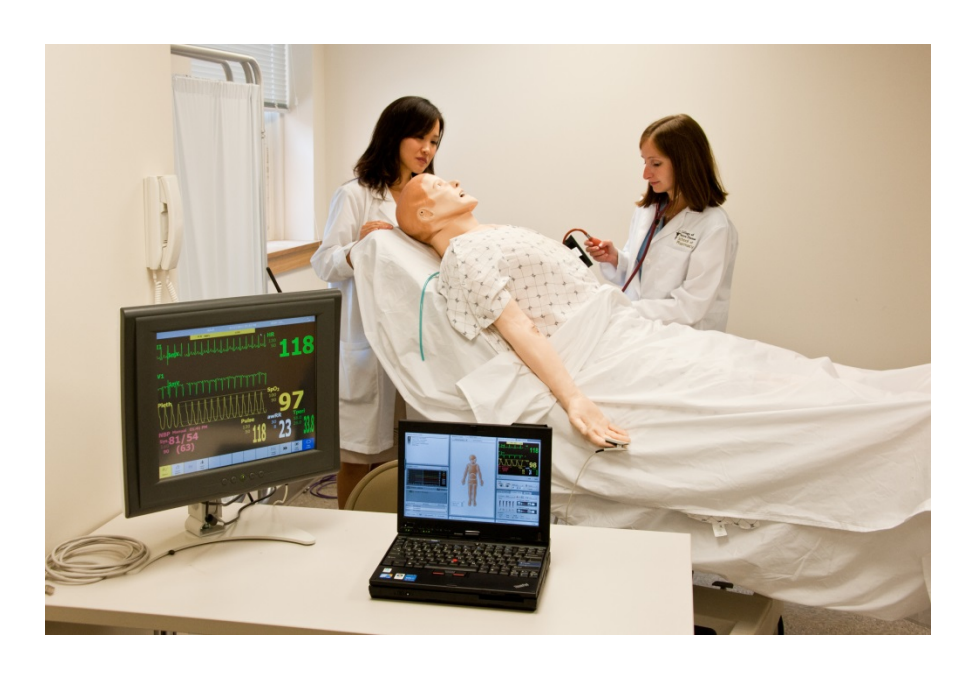
Pharmacy Practice Simulation Lab