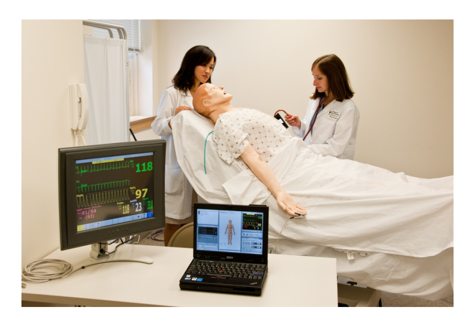
Pharmacy Practice Simulation Lab

All correspondence from University offices is sent to the student's priority address on file in the Registrar's office. Any change to this address should be reported to the Registrar's office as soon as possible. Failure to keep this address up to date may result in delays in receiving important information. It is the student's responsibility to provide the University with correct address information.