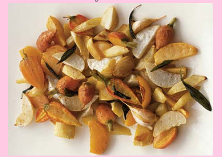
Click here for the recipe.